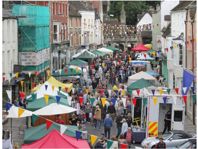
Petticoat Lane map and street scene